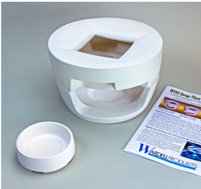
B310 Bundle Components

Create a Contemporary Footed Vase using this 3-Piece Drop-Thru Mold that Automatically Aligns the Glass Drop to the Center of a Wine-Glass Style Foot